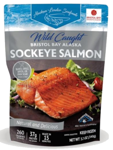
2022 Winner of the Bristol Bay Choice special award – Alaskan Leader Seafoods' Wild Caught Bristol Bay

Alaska Fisheries Development Foundation P.O. Box 2223, Wrangell, AK 99929 www.afdf.org